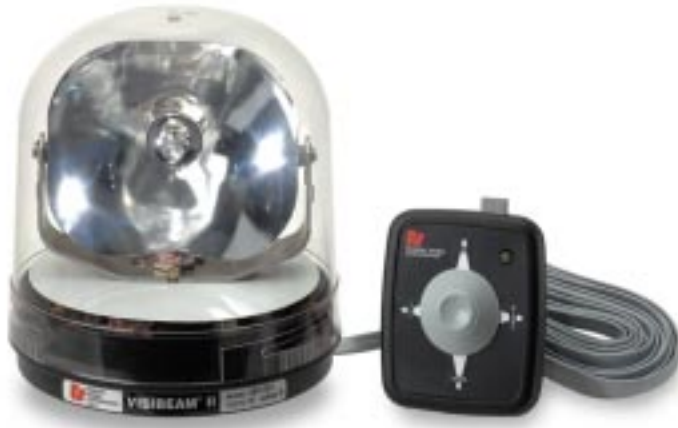
The VisiBeam® II is a high power spotlight with a handheld control unit.

For effective work area illumination, Federal Signal's VisiBeam® II high power spotlight features a handheld remote control head with pinpoint accuracy.