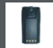
Li-Ion Battery (2000mah)