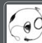
D-Earset With In-Line PTT & Microphone & VOX