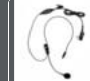
Light-Weight, Behind-The-Head Earpiece With In-Line PTT & VOX