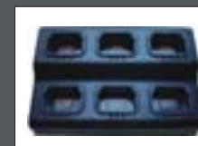
Rapid Rate Multi-Unit Charger For Li-Ion/nI-mh Batteries