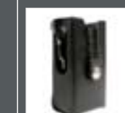
Leather Carrying Case